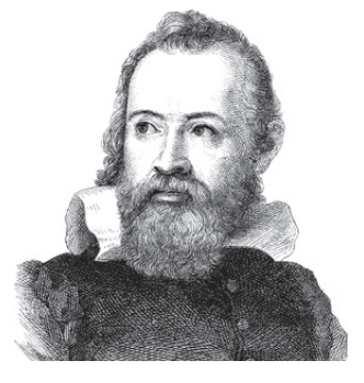
Galileo Galilei, physicist, mathematician, astronomer, discoverer of the heliocentric world view