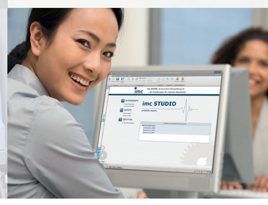
"imc STUDIO is very convincing, with