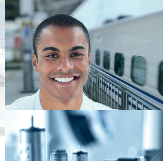
"Whether on the test track, on the test stand or in the laboratory - integrated measurement, control and simulation ensures efficiency. Test and measurement systems from imc are sustainable, flexible and can be expanded to grow with the needs of the customer."

its intuitive approach to system configuration, comfortable handling even of very large numbers of channels and the user-configurable display of live data. With direct data evaluation supported by cursors and markers, post-processing is quite simple."